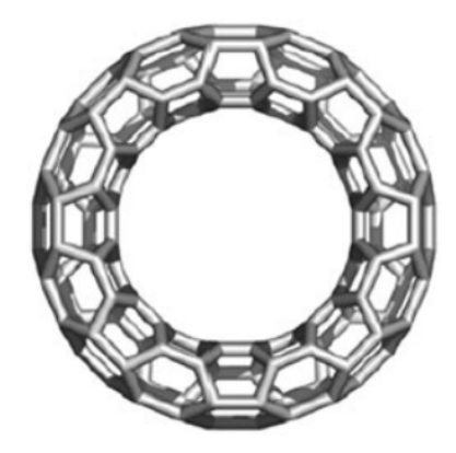
Figure 1. A toroidal fullerene (or achiral polyhex nanotorus) T[p,q].

A nanostructure is an object of intermediate size between molecular and microscopic structures. It is a product derived through engineering at the molecular scale. In what follows, we aim to apply Corollary 2.5 to the molecular graph of a nanostructure called toroidal fullerenes (or achiral polyhex nanotorus) (see Figure 1 and Figure 2).